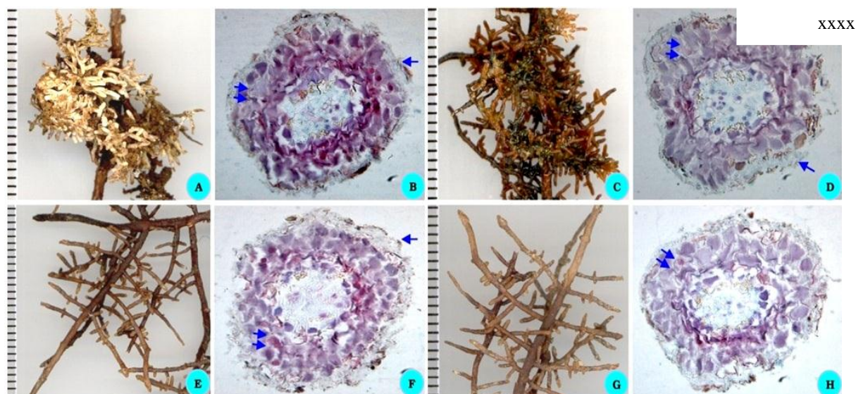
Fig. 1: Four Types of Ectomycorrhizae: (a) White type (b) T. S. of White type (c) Dark Reddish Brown type (d) T. S. of Dark Reddish Brown type (e) Dark Brown type (f) T. S. of Dark Brown type (g) Light Brown type (h) T. S. of Light Brown type. Fungal mantle ( → ) and Hartig net ( ⇨ )